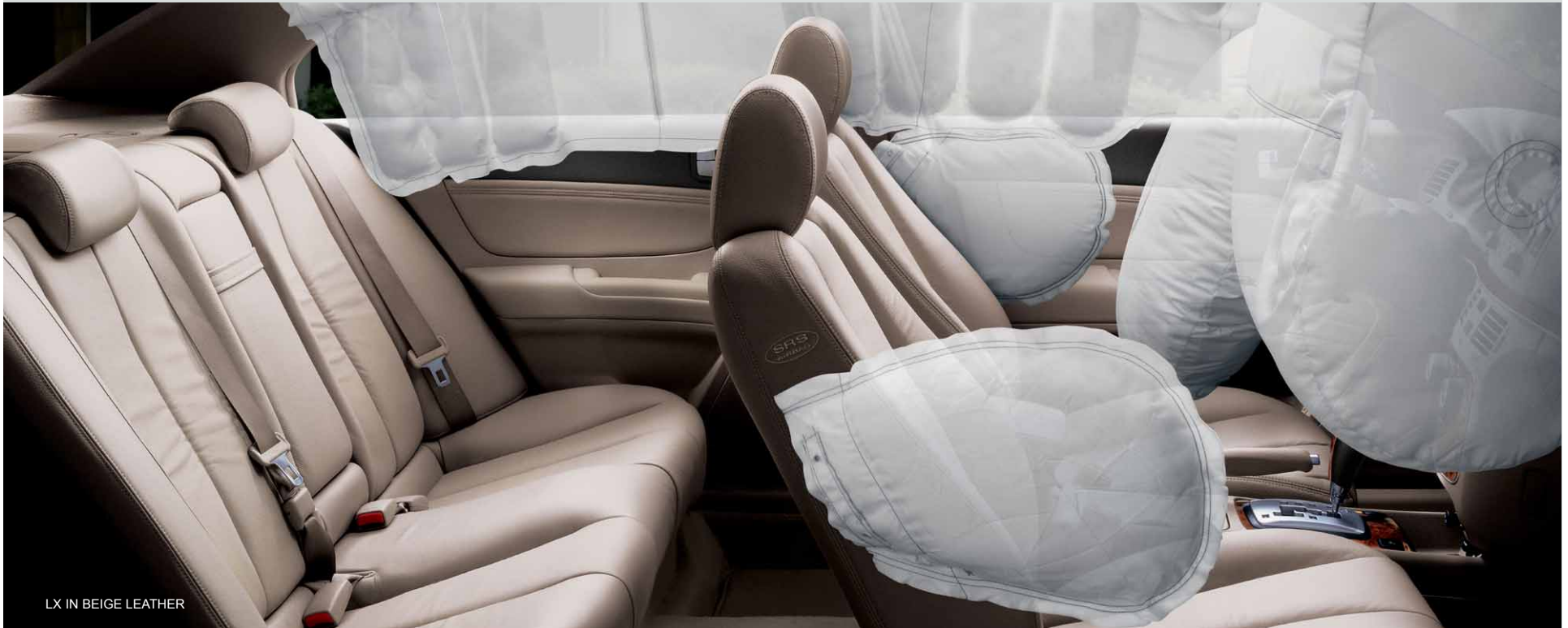
LX IN BEIGE LEATHER